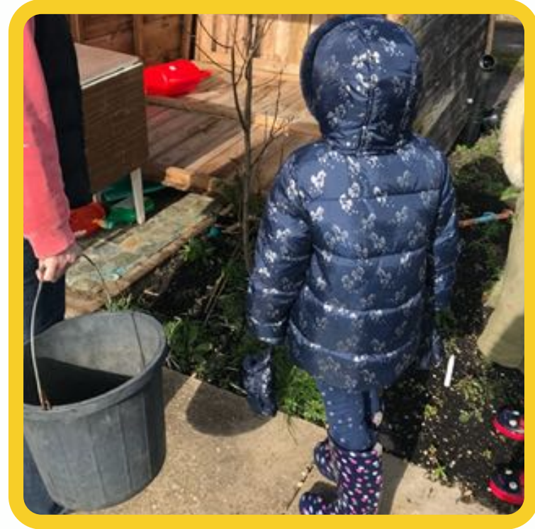
Enjoying the outdoors