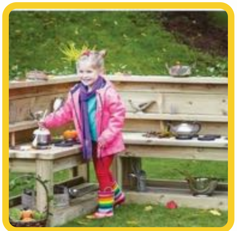
Getting our hands dirty!